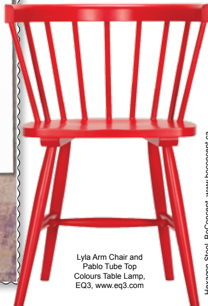
Lyla Arm Chair and Pablo Tube Top Colours Table Lamp, EQ3, www.eq3.com