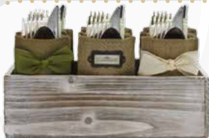
Cutlery Couture, www.cutlerycouture.com

Hey Santa! I would love to get these chic, cutlery holders to use during a dinner party! I love the rustic look of the burlap paired with the barn board display unit.