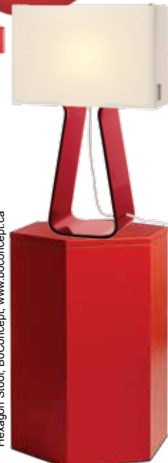
Hexagon Stool, BoConcept, www.boconcept.ca

Zima Branches, Urban Barn, www.urbanbarn.ca