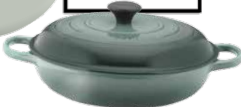
Le Creuset Cast-Iron Braiser, Williams-Sonoma, www.williams-sonoma.ca

Paxton Glass Pendant, Chenille Pillow, Annie Wool Rug, Pottery Barn, www.potterybarn.ca