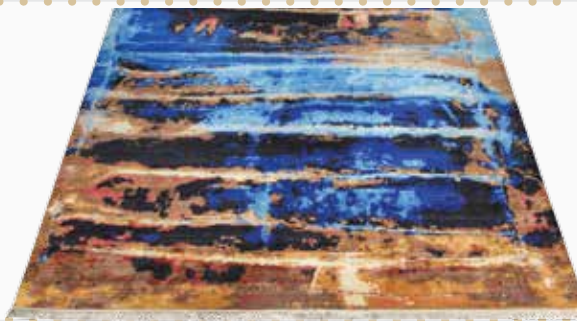
WSTUDIO Decorative Carpets, www.wstudio.ca

Hi Big Fella, The top of my wish list this year is a beautiful silk rug that I've been coveting. Every time I go and source a rug for my clients, I think I ought to treat myself!