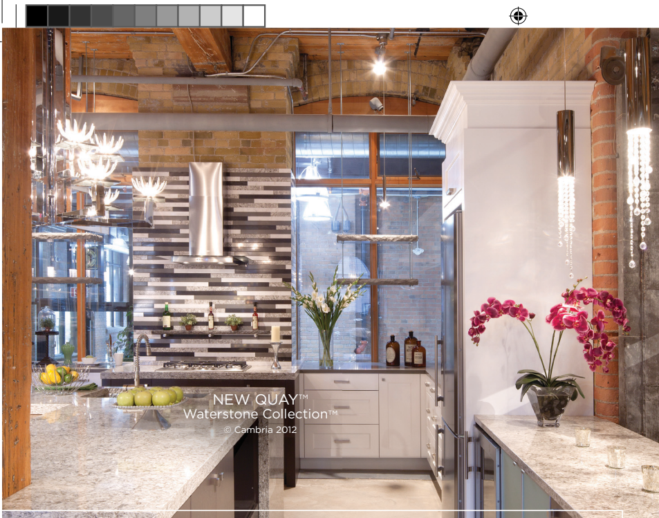
NEW QUAY™ Waterstone Collection™ © Cambria 2012